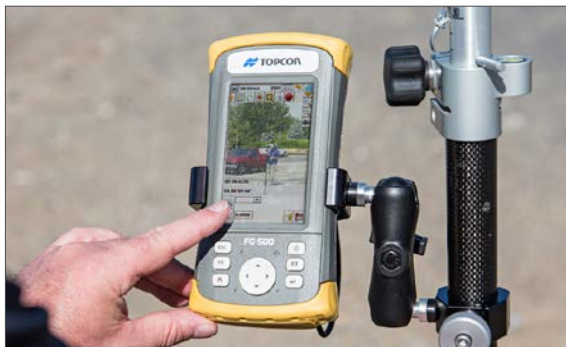
Photo documentation with live video

When connected with an external data collector, LongLink™ communication provides the power at the remote rod position. The remote operator records the data for codes and rod heights for as-builts, eliminating most common errors. For stakeout, the remote operator can view directions required to find the stake point. The system becomes an economical robotic system where the instrument man simply needs to follow and aim at the remote prism. The DS with the XPointing feature finds the center of the prism automatically. LongLink communication is built into the RC-5 and has the ability to send a signal to the total station to quickly re-acquire the prism.